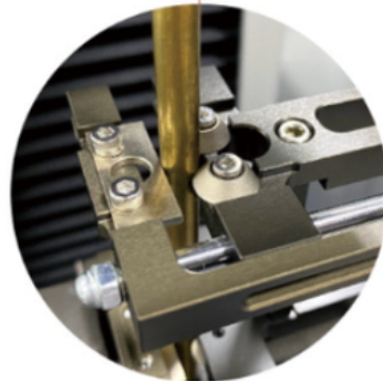
Clamp for Rod Type Specimen